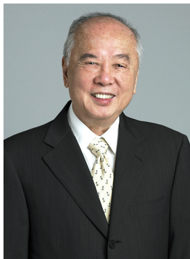
Wee Cho Yaw